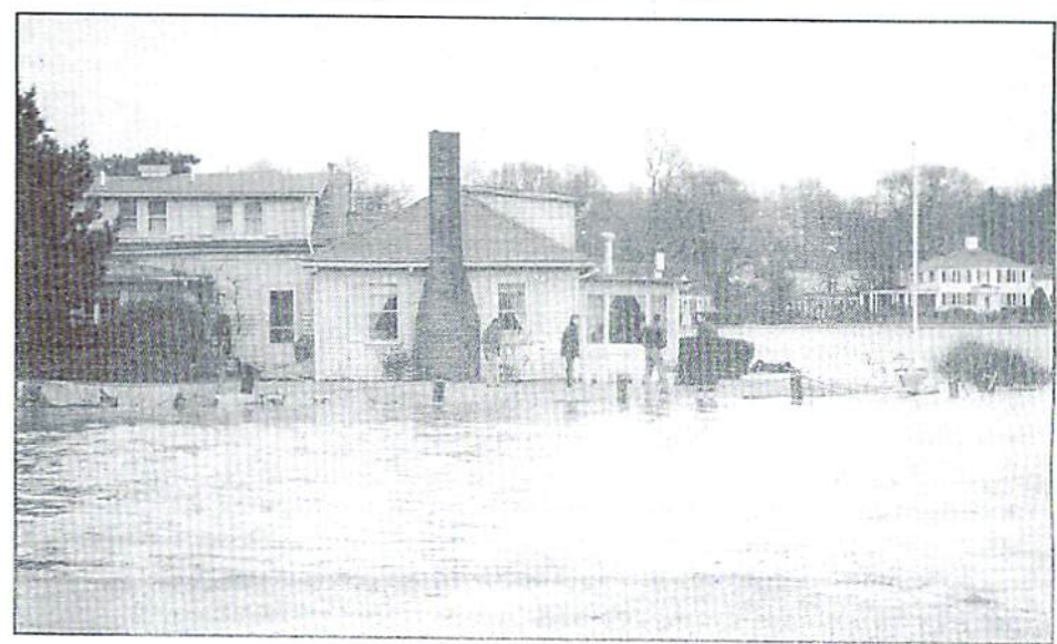
Ground level high tide surges into Bluefish River under and over the bridge.